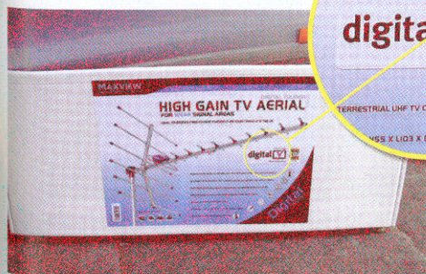
Digital tick logo means the kit is digital ready

You then need a digital signal finder, to help you pick up your choice of channels in seconds.